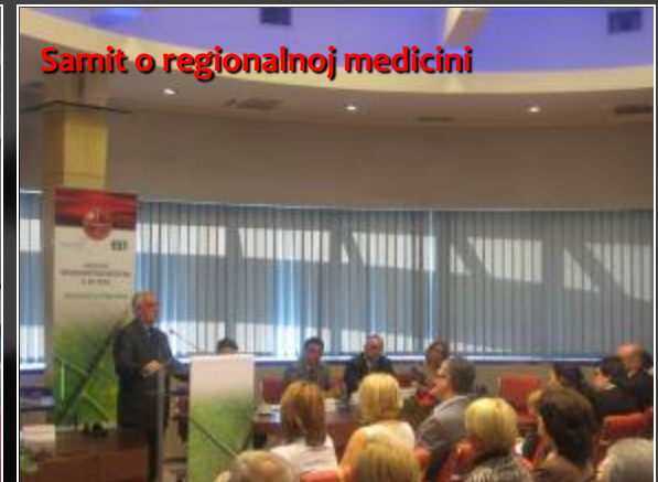
Samit o regionalnoj medicini